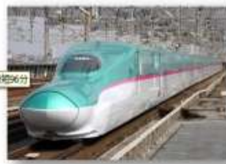
Tohoku Shinkansen (Bullet train)

○ Shinkansen Tokyo ○ (1h 30min) ○ Sendai There are approx. 60 round trips a day (Approx. 30 out of 60 round trips require less than 2 hours travel time.)