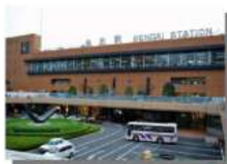
JR Sendai Station

Since Sendai Station is connected to Tokyo by the Tohoku Shinkansen Line, you can easily visit Sendai from the Tokyo metropolitan area in a short time.